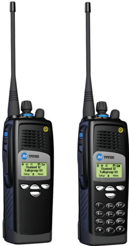
Models shown IS TP9155 and IS TP9160